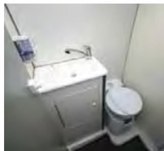
WASH AND GO It's a great washroom but there's not much thigh room on the toilet for those of us built for comfort rather than speed