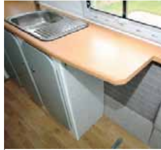
WORKTOP PREMIUM Furthest forward section of the worktop raised into position also provides a cantilever table for those needing to sit at tasks