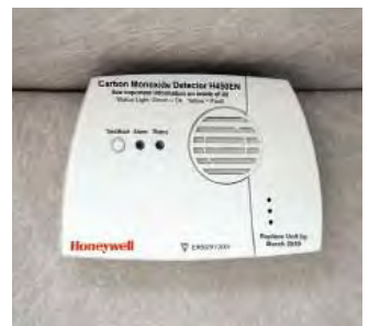
SAFETY FIRST A CO detector, smoke detector, fire extinguisher, fire blanket, first-aid kit, warning triangle and spare 'van bulbs are all standard