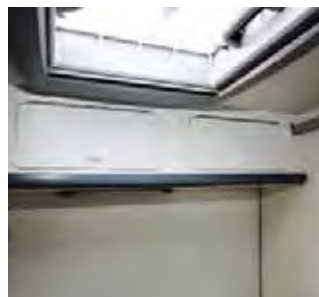
ONE FOR YOU AND FOR ME Separate cupboards for each motorcaravanner's toiletries should avoid a major falling out. Notice the large opening rooflight