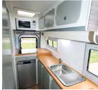
GREAT GALLEY Efficient use of space, plus good worktop and natural light, pushes all the buttons. A choice of hobs, ovens and fridges is available

This is a dedicated two-berth for dedicated motorcaravanners. This 'van is aimed at those who prefer to sleep in single beds (usually). Have a think about the 5.99m version before signing on the dotted line