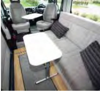
TABLE FOR TWO Certainly – but also a choice of two tables. One sits on a pedestal leg, the other is freestanding... so perfect for alfresco dining