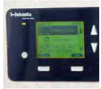
HOT STUFF Control panel for very powerful dual-fuel (diesel/230V) 8kW Webasto Dual Top boiler with blown-air heat distribution

MOVING REARWARDS Spacious kitchen is to the right, with a large wardrobe on the left, ahead of the rear washroom. Sliding windows allow through ventilation when in transit