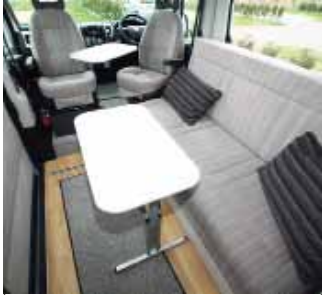
TABLE FOR TWO Certainly – but also a choice of two tables. One sits on a pedestal leg, the other is freestanding... so perfect for alfresco dining