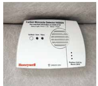
SAFETY FIRST A CO detector, smoke detector, fire extinguisher, fire blanket, first-aid kit, warning triangle and spare 'van bulbs are all standard