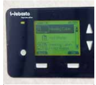
HOT STUFF Control panel for very powerful dual-fuel (diesel/230V) 8kW Webasto Dual Top boiler with blown-air heat distribution

MOVING REARWARDS Spacious kitchen is to the right, with a large wardrobe on the left, ahead of the rear washroom. Sliding windows allow through ventilation when in transit