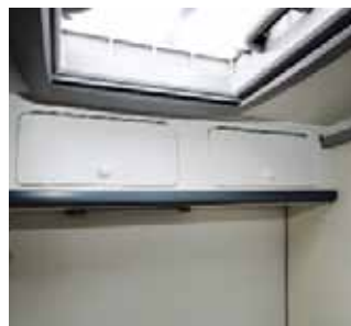
ONE FOR YOU AND FOR ME Separate cupboards for each motorcaravanner's toiletries should avoid a major falling out. Notice the large opening rooflight