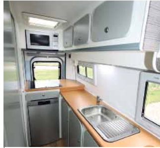
GREAT GALLEY Efficient use of space, plus good worktop and natural light, pushes all the buttons. A choice of hobs, ovens and fridges is available

This is a dedicated two-berth for dedicated motorcaravanners. This 'van is aimed at those who prefer to sleep in single beds (usually). Have a think about the 5.99m version before signing on the dotted line