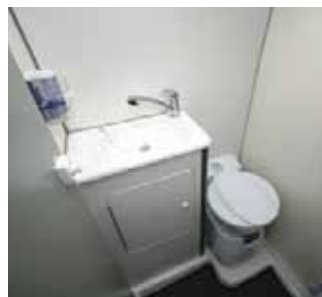
WASH AND GO It's a great washroom but there's not much thigh room on the toilet for those of us built for comfort rather than speed